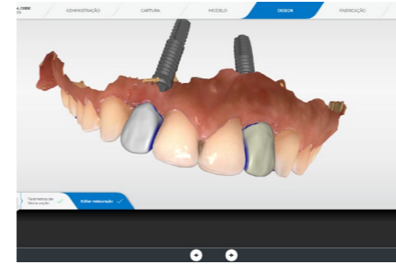
Design of the crowns in the CEREC Software.