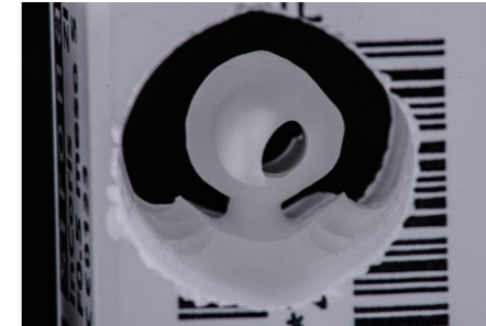
Milled zirconia abutment.