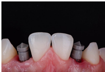
Nine months after removal of the old implants and three months after placement of the new implants. Scan of the new implant position with scan posts.