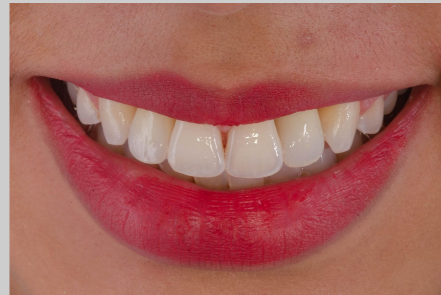
After: Final smile