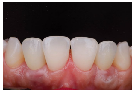
Final restoration of teeth 12 and 22.