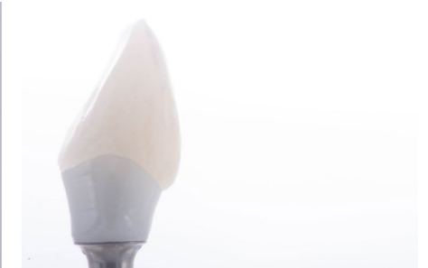
Adjustment of the CELTRA DUO crown on the InCoris meso abutment.