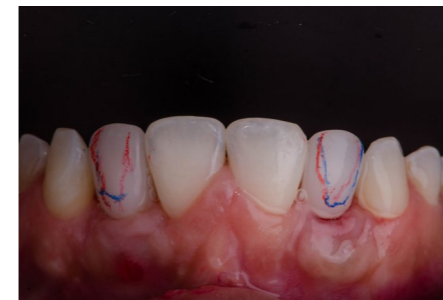
Marking for the esthetic adjustment of the crowns.