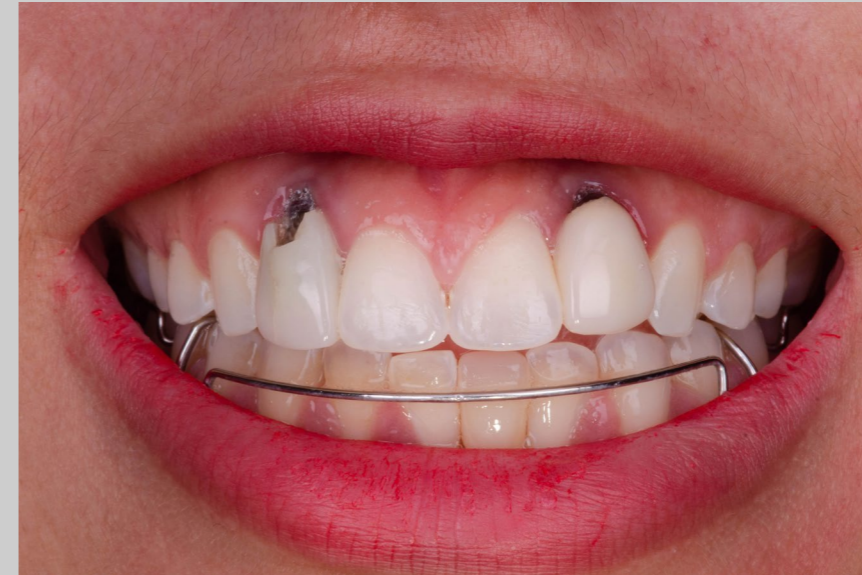
Before: Initial situation