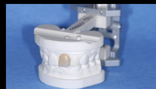
iTero model with crown in place