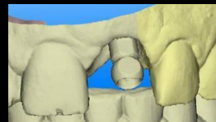
Digital model based on the digital impression with ATLANTIS IO FLO