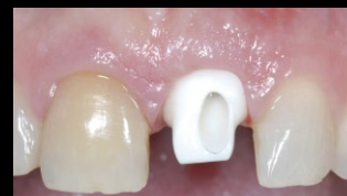
ATLANTIS patient-specific abutment in zirconia is placed and torqued to 25 Ncm