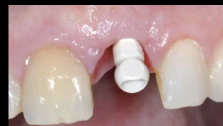
Intraoral scanning was performed with an ATLANTIS IO FLO seated in an OsseoSpeed EV implant

ATLANTIS IO FLO is indicated for all positions in the mouth, and available for all major implant systems.